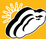
OPTIMIZED FOR ALL SUNLIGHT CONDITIONS