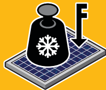
ROBUST AND DURABLE DESIGN